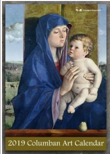
2019 Columban Art Calendar